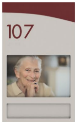
Room Number C 6" x 10" • Photo insert slot (4" x 6") • Name insert slot (1.375" x 6") • 1/32" Raised text • Grade 2 braille