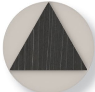
California Restroom C | Unisex 12"x12"