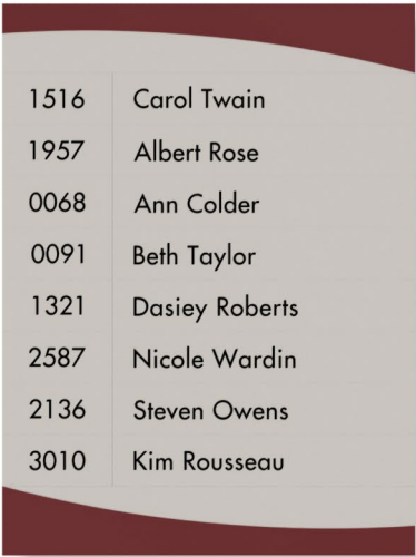
Directory A 15" x 20" • Digital print text • Removable magnetic room numbers & nameplates