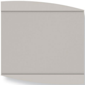
Evac Insert 11" x 11" • Paper insert slot (8.5" x 11") Window (8.375" x 11")