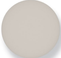
California Restroom B | Womens 12"x12"