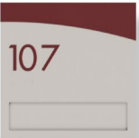
Room Number B 6" x 6" • Name insert slot (1.375" x 6") • 1/32" Raised text • Grade 2 braille