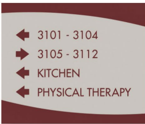
Directional A 10" x 12" • 1/32" Raised text or digital print