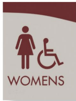
Restroom ID A 6" x 8" • 1/32" Raised text/pictogram • Grade 2 braille