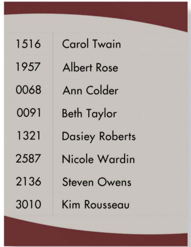
Directory A 15" x 20" • Digital print text • Removable magnetic room numbers & nameplates