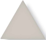
California Restroom A | Mens 12"x10.4"