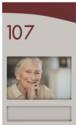
Room Number C 6" x 10" • Photo insert slot (4" x 6") • Name insert slot (1.375" x 6") • 1/32" Raised text • Grade 2 braille