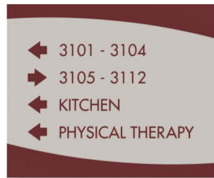
Directional A 10" x 12" • 1/32" Raised text or digital print