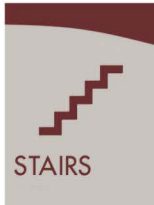
Stair ID 6" x 8" • 1/32" Raised text/ pictogram • Grade 2 braille