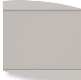
Evac Insert 11" x 11" • Paper insert slot (8.5" x 11") Window (8.375" x 11")