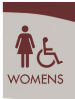
Restroom ID A 6" x 8" • 1/32" Raised text/ pictogram • Grade 2 braille