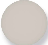
California Restroom B | Womens 12"x12"