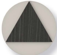
California Restroom C | Unisex 12"x12"