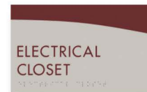
Room Name C 8"x5" • 1/32" Raised Text • Grade 2 Braille