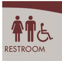
Restroom ID B 8" x 8" • 1/32" Raised text/ pictogram • Grade 2 braille